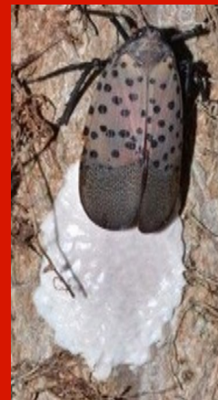
Above: A spotted lanternfly depositing egg masses.

Conservation District Staff, Steve and Kate, discussed site inspection procedures related to Chapter 102 regulations and updated invasive species information on the spotted lanternfly. The spotted lanternfly prefers to eat several agricultural crops, including: apples, nut trees, grapes (wine!), and hops (beer!)