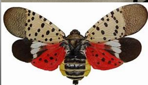
Above: John Ellis speaks about hydraulically applied blankets to over 45 attendees. Left: A photo of the spotted lanternfly. Adults are approx. 1 in. long and 1/2 in. wide.