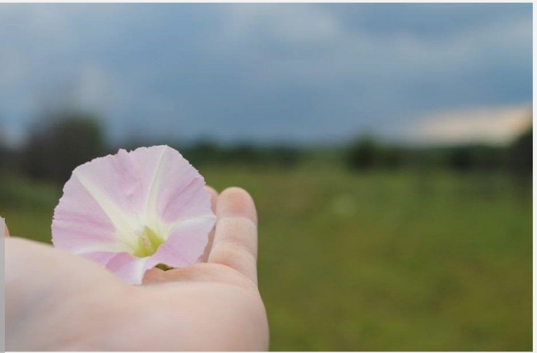
3rd Place Youth: "Through the Eye of a Flower," by Chloe Horning.