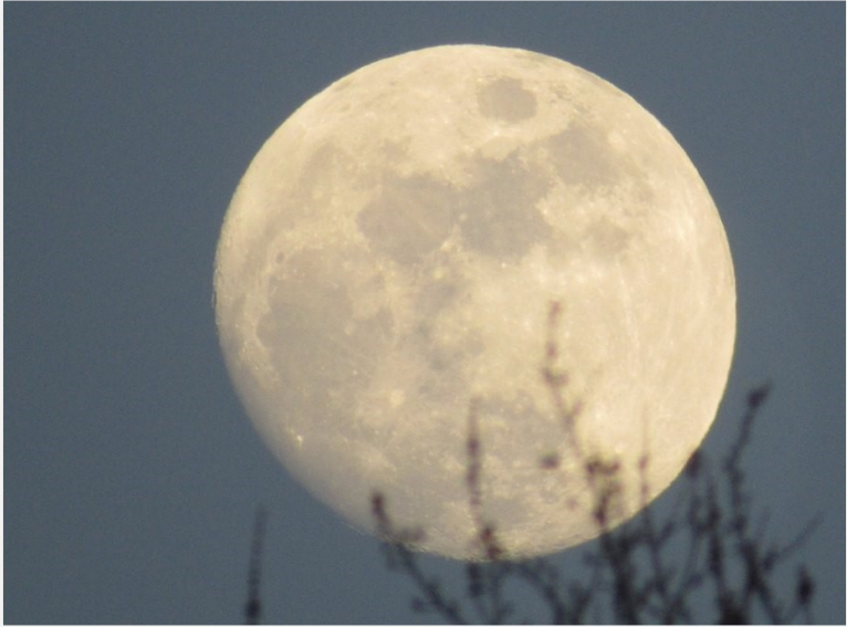
Above: Youth 1st place photo contest entry, "Moon", Submitted by Brendon Dauber.