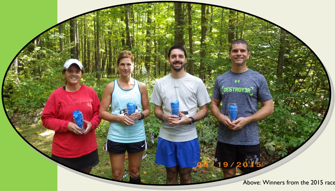
Above: Winners from the 2015 race