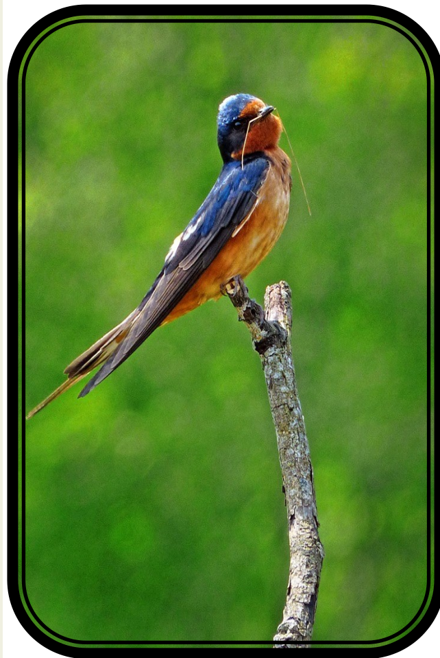
Above: Adult class winner of the photo contest, "Barn Swallow" submitted by Melinda Marconi.

Saint Marys, PA- Winners of the first annual Elk County Conservation District Photo Contest were announced on September 1 st , 2016. The Conservation District had over 50 photos submitted including youth and adult entries.