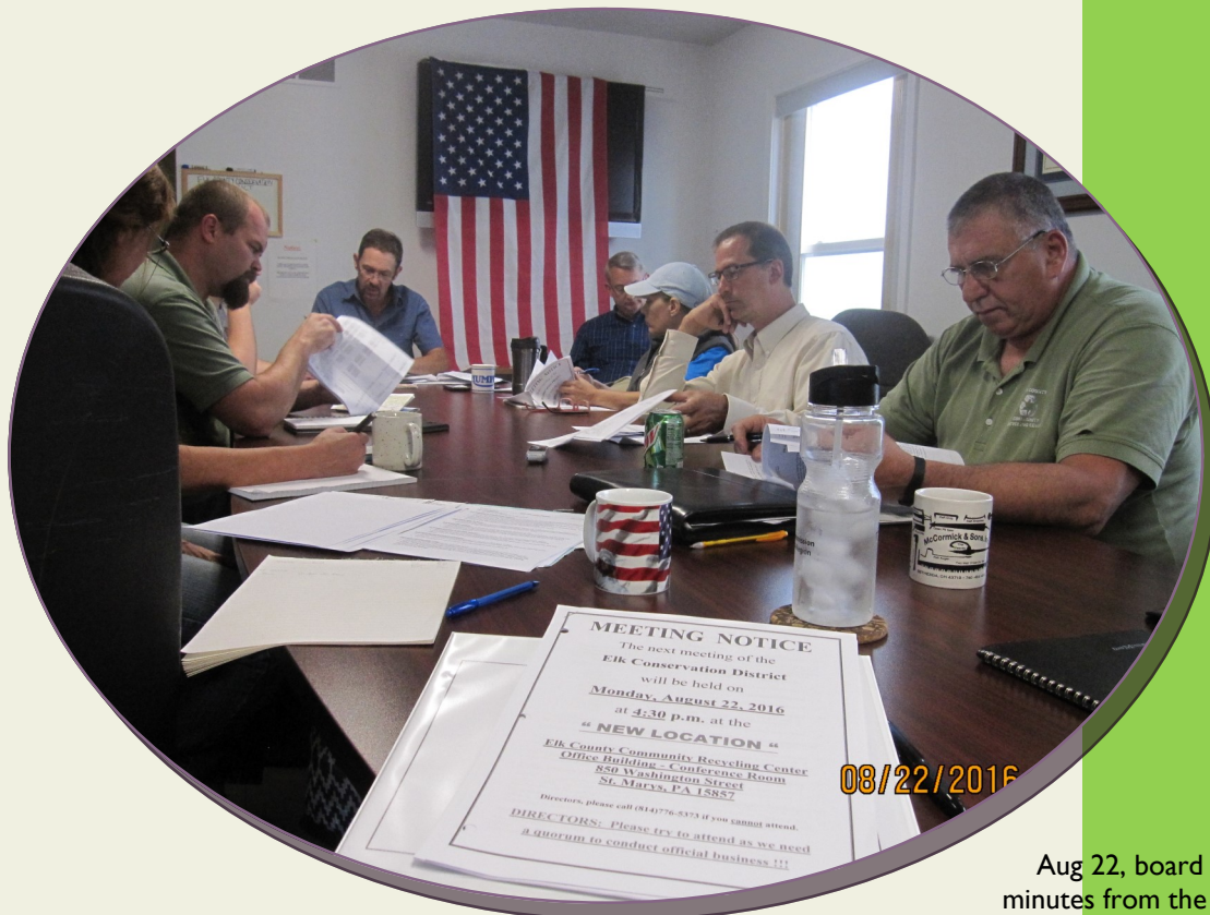
Aug 22, board members read minutes from the previous meeting in new board room.

The Elk County Conservation District held their first board meeting in the new office on August 22 nd . It was a great opportunity for board members to check out the setup and get familiar with the new office space. Overall it seemed as though the board felt like the new space was a good fit. All future board meetings will be held at the new office, located at 850 Washington Street in St. Marys. As always, the public is welcome. The next meeting will be held on September 24 th , 2016.