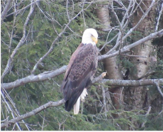
Most Facebook Votes: "Bald Eagle" by Brendon Dauber.