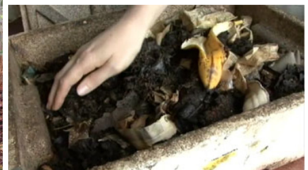
Indoor worm box.