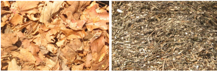
Browns: Leaves and wood chips.