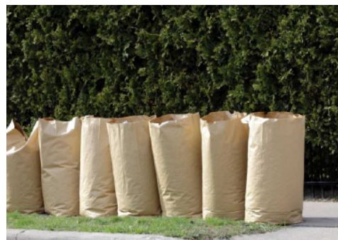
Paper leaf bags.

♦ Paper bags: Paper leaf bags can be a good choice since they have a base that allows them to stand up while loading, and can be incorporated into the compost along with the leaves which avoids the debagging process. However, they can be more expensive to purchase.