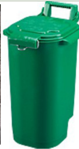
Reusable curbside collection containers.