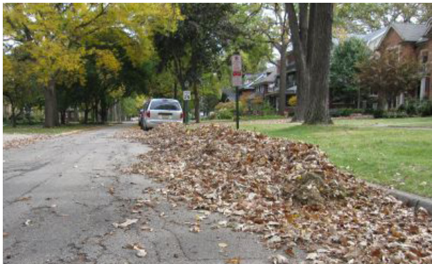
Loose leaves curbside .