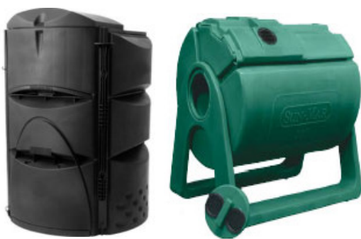
Manufactured continuous feed compost units.

◆ Continuous Feed Compost Units: These composters are designed to be fed daily. Feedstocks go in one end and compost comes out the other. These include rotating drum and bin composters that are designed specially to push waste through the system, and also include indoor, electric composters.