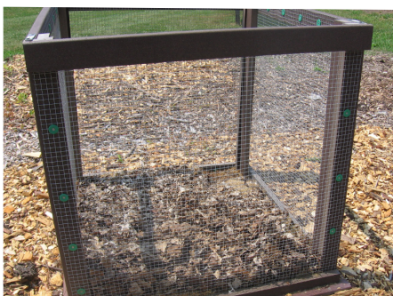
Homemade on-ground compost units.