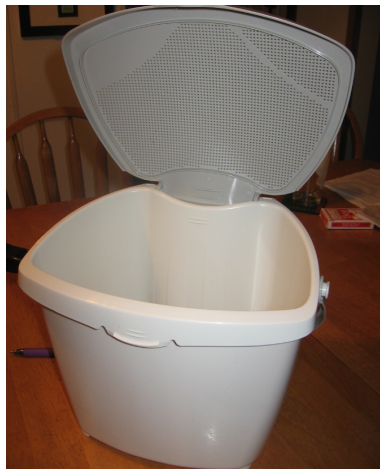
Kitchen container with locking lid and aeration holes.