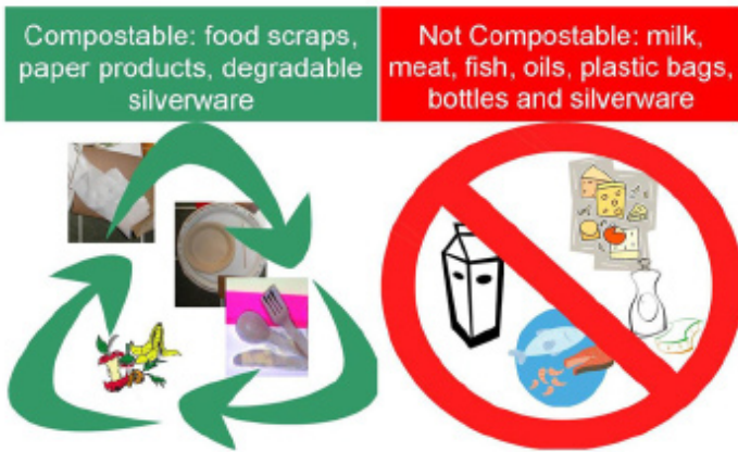
Example signage for home separation.

Any food preparation or post plate material, spoiled food, napkins, and degradable serviceware can be composted. Milk and meat products are not generally added to home compost piles, but can be composted by municipalities collecting organics because they compost greater volumes of residuals and reach proper temperatures. Signage can help while learning what to put into the containers and where many people use a shared kitchen.