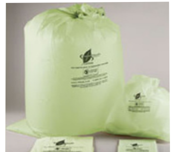
Compostable plastic bags.

♦ Compostable plastic bags: These bags are designed to be incorporated into compost windrows with the yard waste and no debagging should be necessary. These bags tend to be more expensive than the petroleum-based bags but may save in labor.