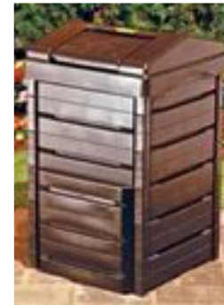
Manufactured on-ground compost units.

a product more quickly, turning will help to speed the process. The pile can be turned with a pitch fork or shovel, which helps to break up material and better homogenize the mass.