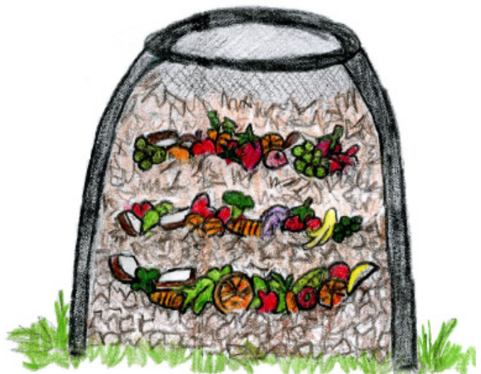
Cross-section of layered browns and greens.

Layering and choosing the right organic material creates the right environment for compost to “happen”. Start with a layer of coarse “browns” in contact with the soil. Make a well or depression in this layer and put the “greens” into the well. Keep the food scraps away from the outside edges of the pile (only brown material should be visible). Cover your “greens” with a generous layer of “browns” so that no food is showing. This will keep insect and animal pests out of the pile and filter any odor. Keep adding layers of greens and browns (like making lasagna). Keep layering the feedstock until the mass reaches a height of 3 to