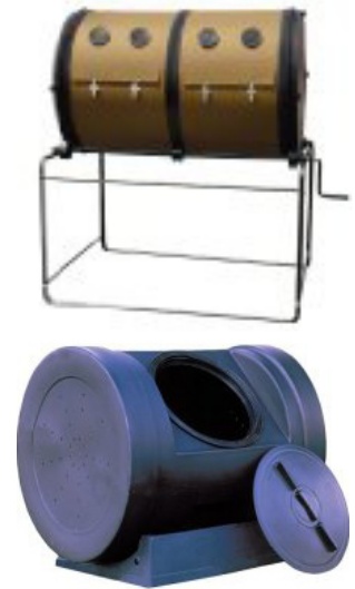
Manufactured rotating drum compost units.