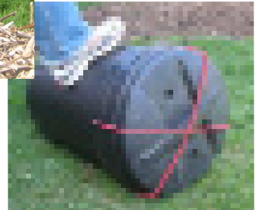
Homemade rotating drum compost units.