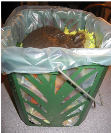
Kitchen container with compostable bag.