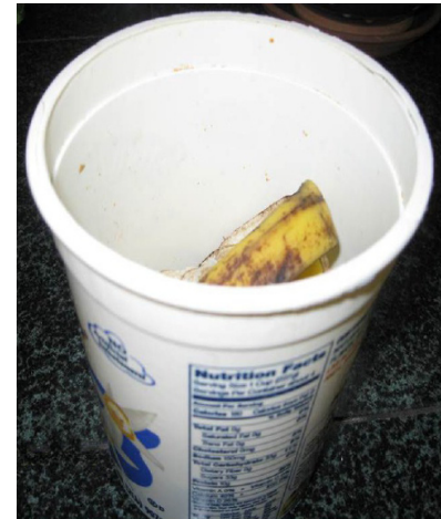
Recycled kitchen container.